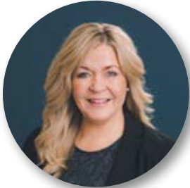
Mayor Jackie Clayton