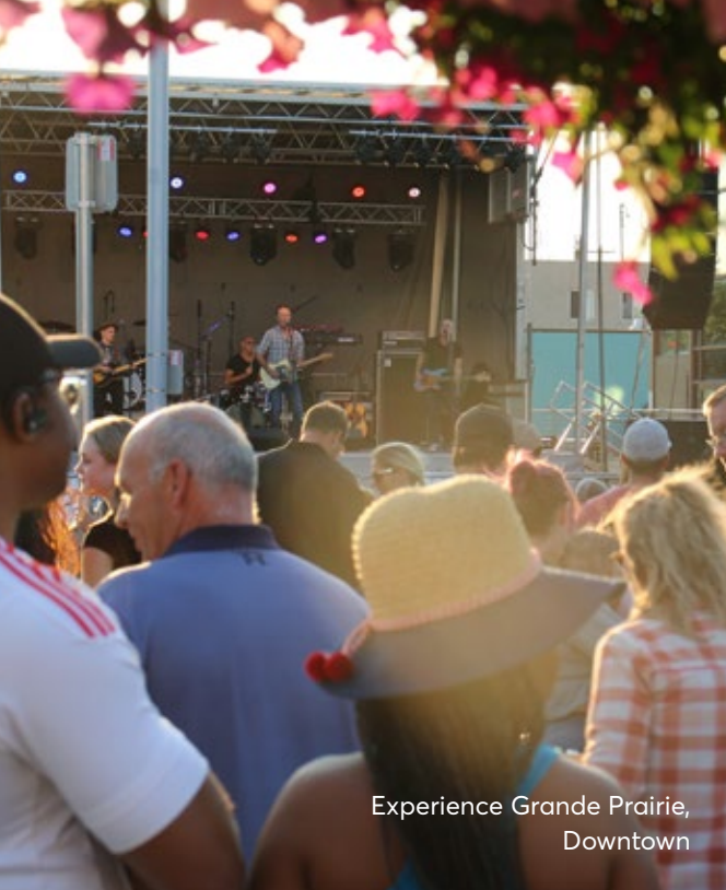
Experience Grande Prairie, Downtown