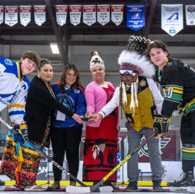
National Aboriginal Hockey Championships 2024, Design Works Centre