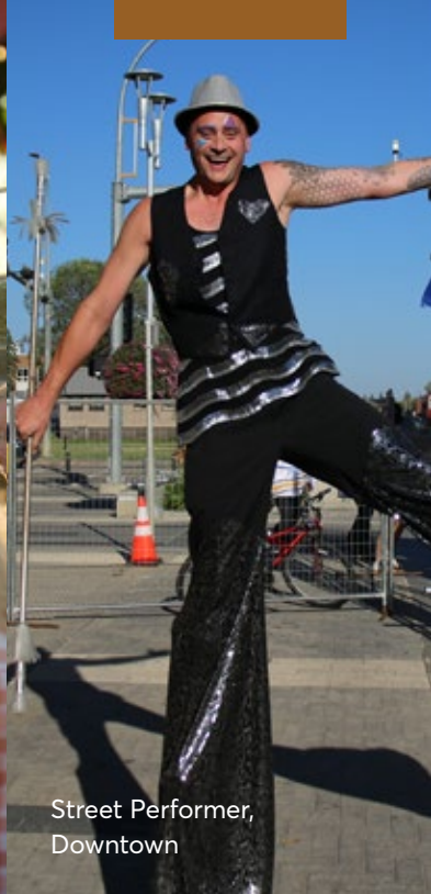
Street Performer, Downtown