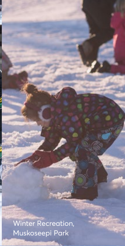
Winter Recreation, Muskoseepi Park