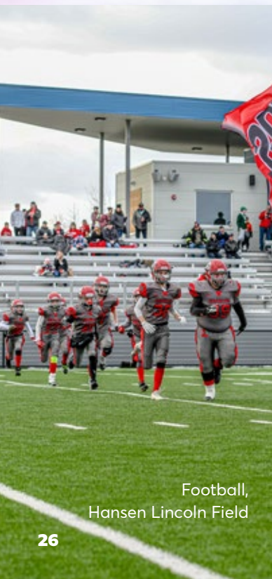
Football, Hansen Lincoln Field