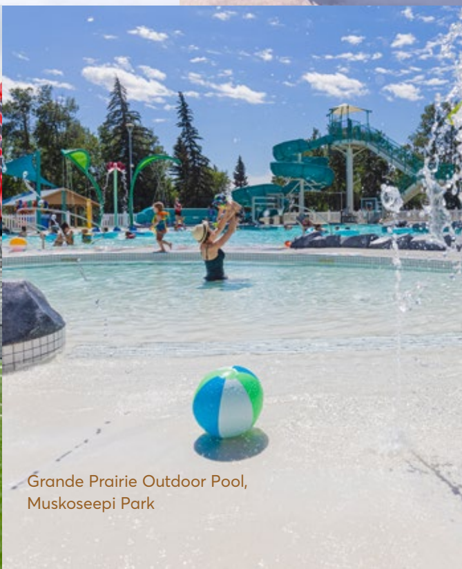
Grande Prairie Outdoor Pool, Muskoseepi Park