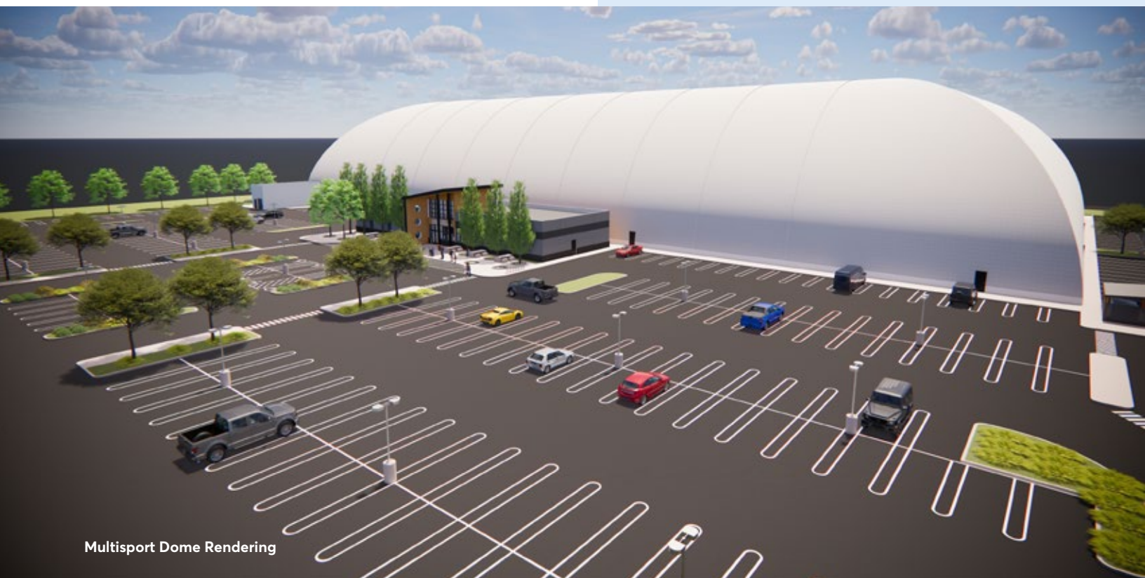
Multisport Dome Rendering