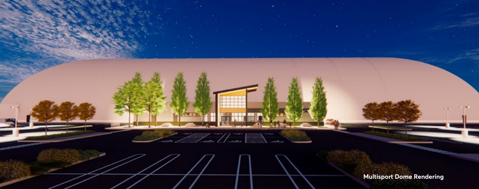
Multisport Dome Rendering