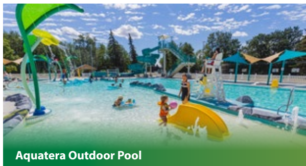
Aquatera Outdoor Pool

The Aquatera Outdoor Pool celebrated its 60th anniversary this year on July 16. The day was celebrated with free public swimming and activities that included decade themed pool & lawn games, and door prizes.