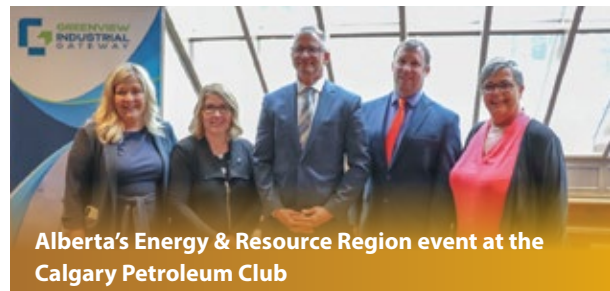
Alberta's Energy & Resource Region event at the Calgary Petroleum Club

This was one of many events Council hosted in partnership with other levels of government to support and advocate for our region, including the Innovation & Investment Event in Calgary in September and An Evening with Grande Prairie in Edmonton in February, and more!